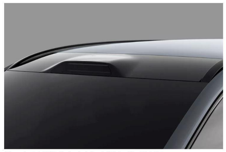
Volvo says Luminar's LIDAR will be "seamlessly integrated" into its vehicles.

Most autonomous vehicles developed to date use one or more LiDAR sensors to construct a 3D map of the vehicle's surroundings. These sensors are costly and no production car has them at present. Bucking the trend, Volvo has announced that its 2022 XC90 SUV production vehicles will include a low-profile LiDAR unit integrated into the front windshield. Volvo also indicates that it is developing a self-driving highway feature named Highway Pilot as part of its next big platform update, the Scalable Product Architecture (SPA2). Volvo says that the combined LiDAR and Highway Pilot system will be able to drive completely autonomously on certain pre-selected highways without needing any driver intervention or monitoring. Details are at this link.